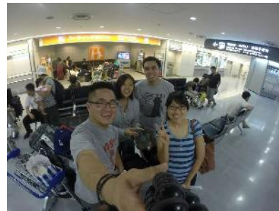
Arriving tired but happy at the Tokyo airport on Thurs., Aug. 7