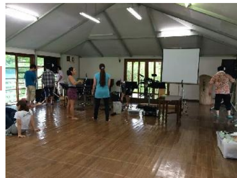
Getting ready for camp with the staff