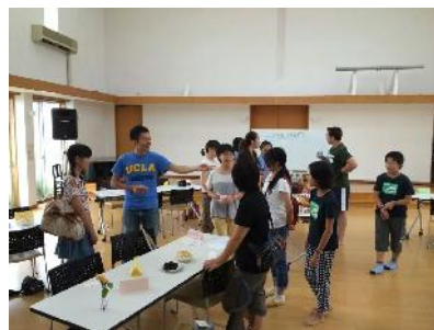
Café fellowship at Rifu Oasis Chapel