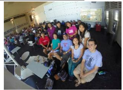
GVBC sendoff at LAX on Wed., Aug. 6

They have plenty of wonderful stories to tell us about their mission trip to Rifu Japan.