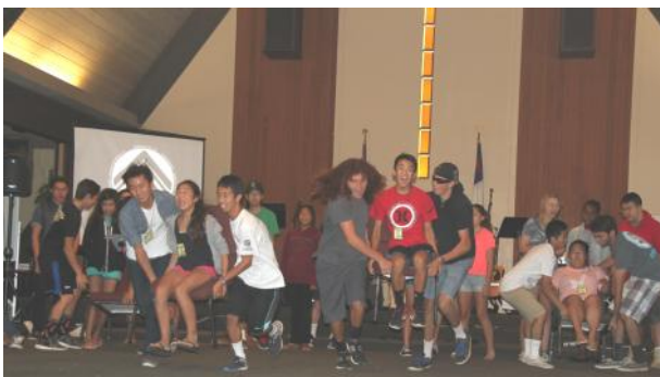
Fun and games