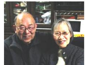
Child Evangelism Fellowship of Japan