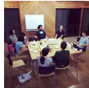
Meeting with Rifu Oasis Chapel Staff