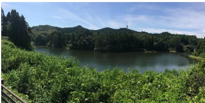
View from Camp Morigo: Adventure Camp